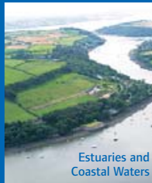
Estuaries and Coastal Waters